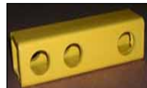
Top Link Tube AG2010