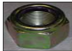
5/8-11x1-1/4" Locknut AG2012