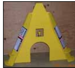
Receiver Plate RP5522