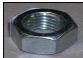
5/8x11x2 Nut AG2802