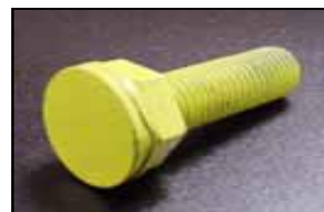
Strike Plate AG2019