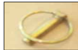
Lynch Pin AG2014