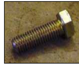
5/8-11x1-1/4" Hex Bolt AG2023