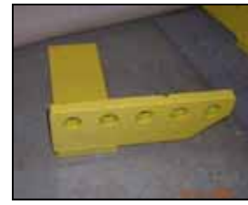
Right Angle Bracket AG2016