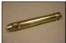
Top Link Pin AG2013